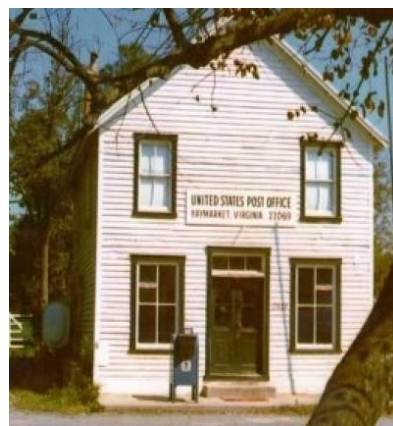
Old Post Office Building

store, The Red Rooster in 2012. The Old Post Office now houses its current tenant, Washington Street Reality. The original doors for the Post Office still hang today.