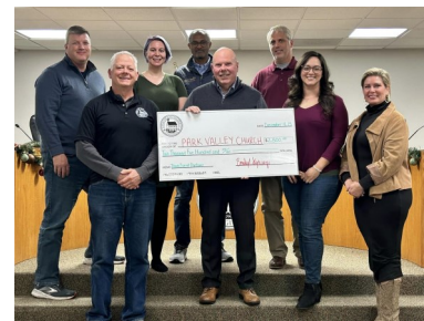
Thank you Park Valley Church for always helping and supporting Town events!