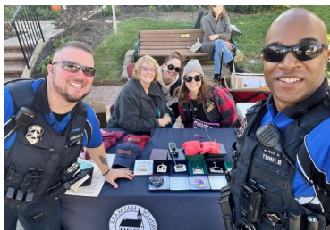
Town Staff at Haymarket Day!