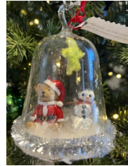
Children’s Category Winner: The Maquire Family. This one pictured used broken ornaments to make a new one!