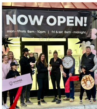
Crumbl Cookies ribbon cutting. Welcome to Town!