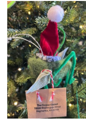
In Town Business winner goes to Copper Cricket!