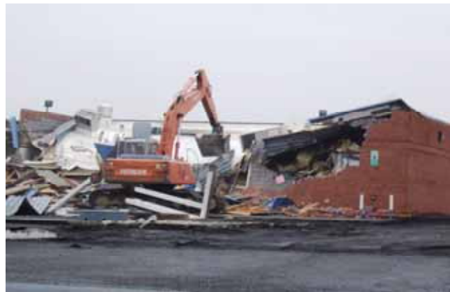
Demolition of Quarles Store on Tuesday, March 16, 2009

The Town is also starting a new Passport Program which is intended to promote the businesses in Town and to provide free merchandise when you purchase from 10 of our stores. We encourage you to visit the www.haymarketpassport.com website to get the details or simply stop by any business in town to pick up your passport.